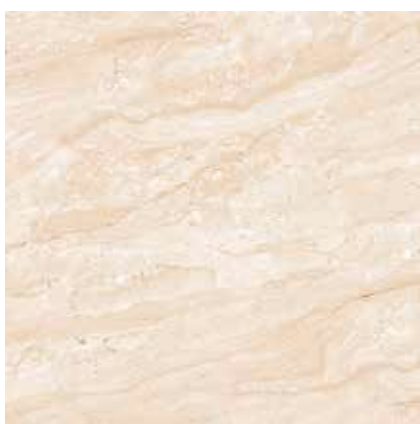
4857 60x60 Tropea Rosa