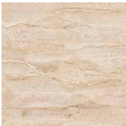
4854 60x60 Tropea Beige