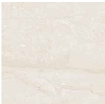
4853 60x60 Tropea Ivory