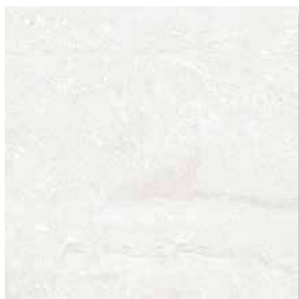
4850 60x60 Tropea Bianco