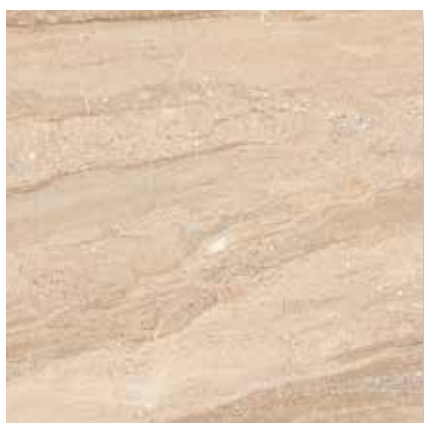
4859 60x60 Tropea Bronzo