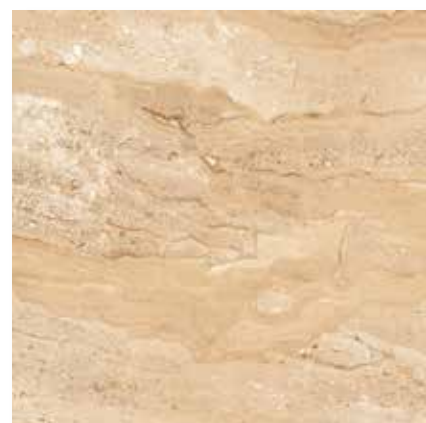
4861 60x60 Tropea Onice