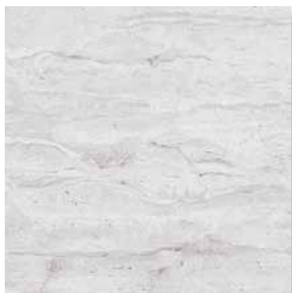
4851 60x60 Tropea Grey