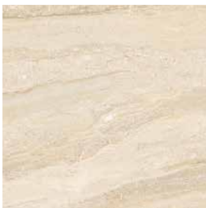
4860 60x60 Tropea Oro