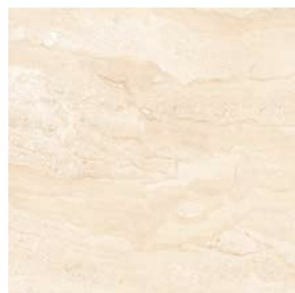
4858 60x60 Tropea Avana