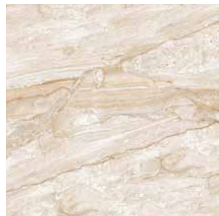
4855 60x60 Tropea Avorio