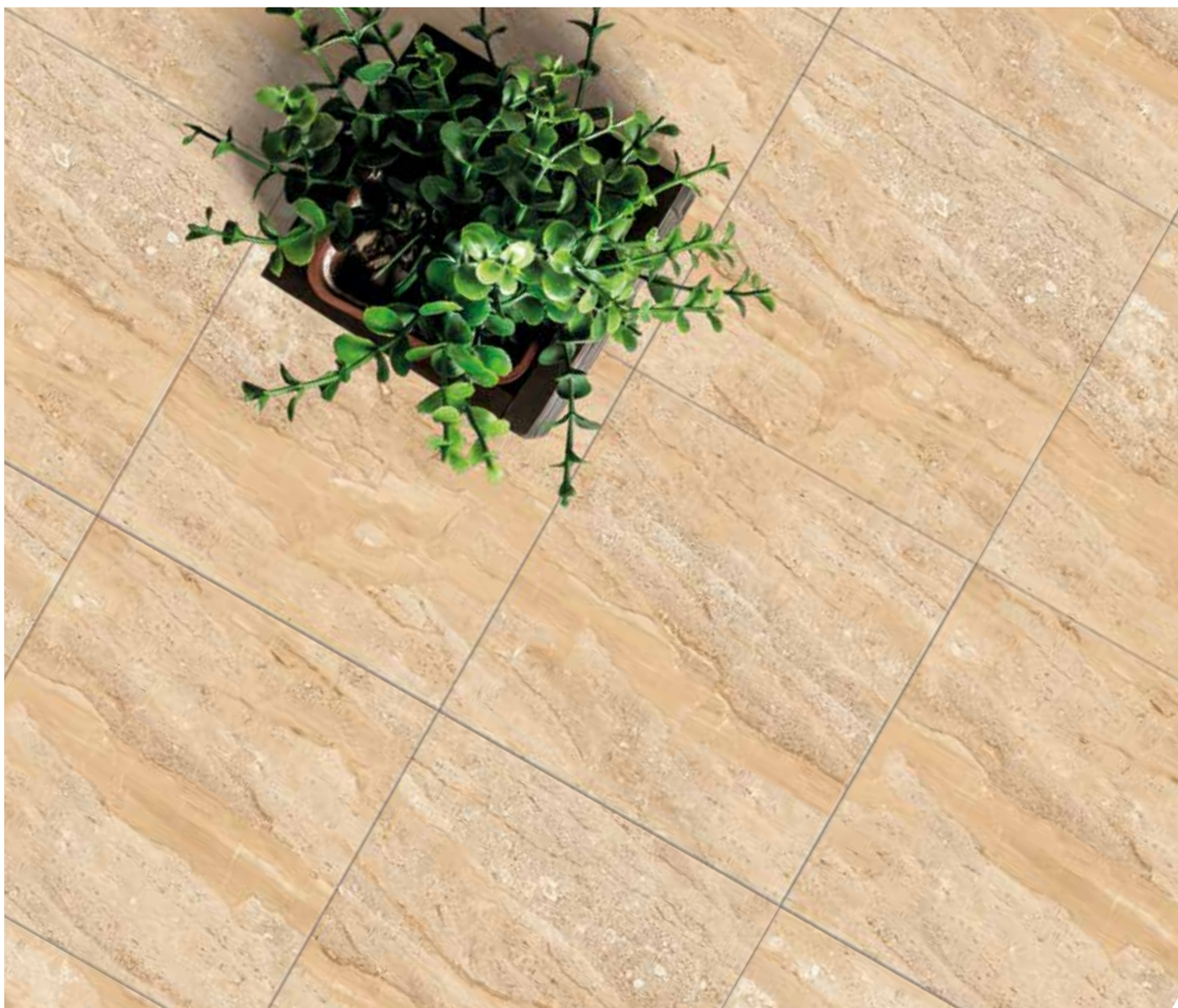
60x60 Tropea Onice