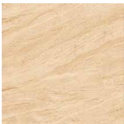
4856 60x60 Tropea Ocra