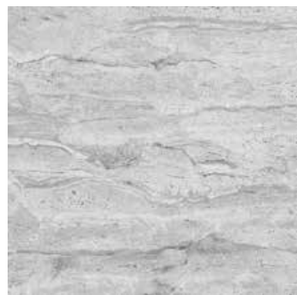
4852 60x60 Tropea Grigio